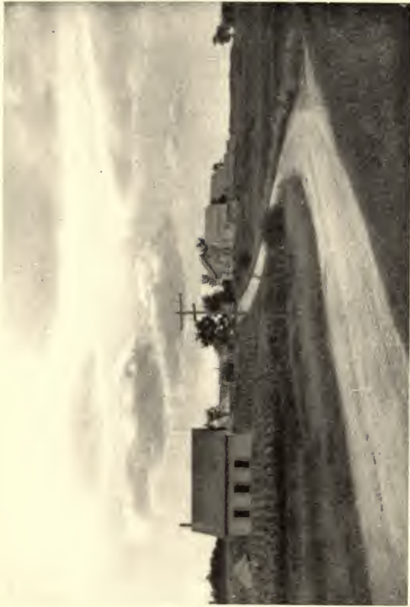
THE BATTLEFIELD, BLACK POINT Captain Benjamin Swett was killed here